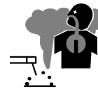
Fumes and gases can be hazardous to your health.