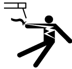
Electric shock can kill.