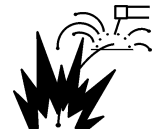
Sparks and splatter can cause fire or explosion.