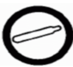
CANADA (WHMIS) SYMBOLS