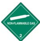
US DOT SYMBOLS